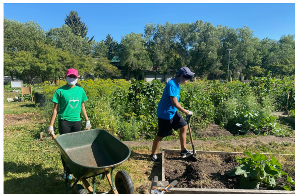
College Park Community Garden

This week was our final week helping out with Food on the Move at the Salvation Army. This project was a favourite among the YV's, and they were always eager to go. We can almost call ourselves professional sandwich makers now! Over the course of the summer, we assisted with making sandwiches, bagging carrots, and packing bags with juice, cookies, and a granola bar. By the end of the summer, the YV's knew exactly what needed to be done and were eager to help!