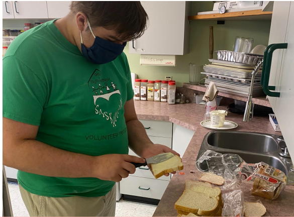
Food on the Move