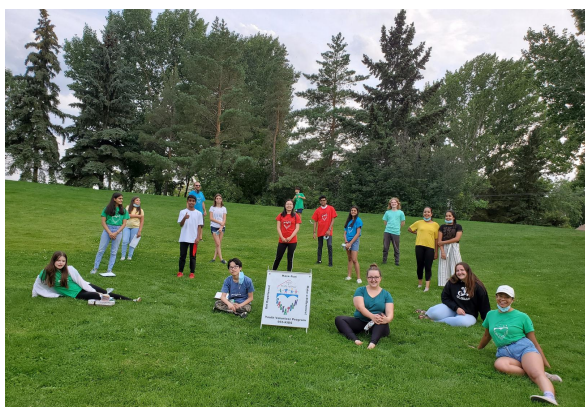
Child & Youth Friendly Saskatoon

This week we wrapped up our final community garden for the year! The growing season may be coming to an end, but Mr. Sun was still shining down on us. We gave the plants a good drink of water while also pulling weeds and ridding the plants of notorious potato bugs. We are so grateful for the opportunity to assist so many community organizations with their community gardens. This summer we became experts in weeding, mulching, planting, and all things gardening. We look forward to lending our services to community gardens in the future!